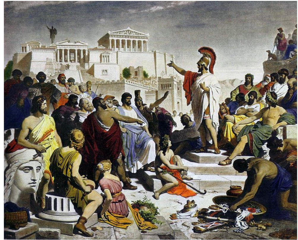
Modern painting depicting Pericles addressing the people. Background: acropolis with Parthenon and Propylaea.